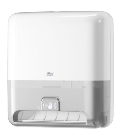
Automatic Dispenser with Sensor (Battery Operated)