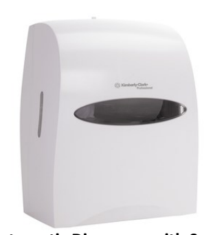
Automatic Dispenser with Sensor (Battery Operated)

Soft feel and premium quality in a roll towel. Preferred for exceptional hand drying performance. Kleenex hard roll towels have absorbency pockets that absorb a lot of water fast for superior hand drying. Highly absorbent so you will use less and waste less. 1½" core size for use only in Kimberly Clarke dispensers